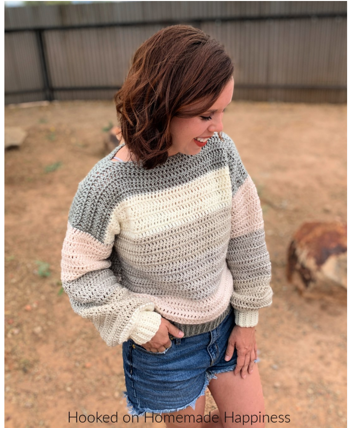
Hooked on Homemade Happiness

This comfy, easy to make Everygirl Crochet Sweater is the perfect addition to your fall wardrobe. I used 3 Caron Cakes to make this sweater. When picking out my skeins, I made sure to find ones that had the same starting color so the stripes on the front and back out (almost) match up.