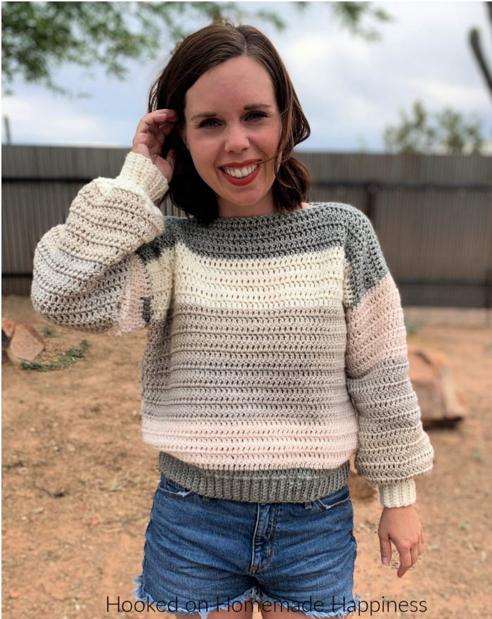
Hooked on Homemade Happiness