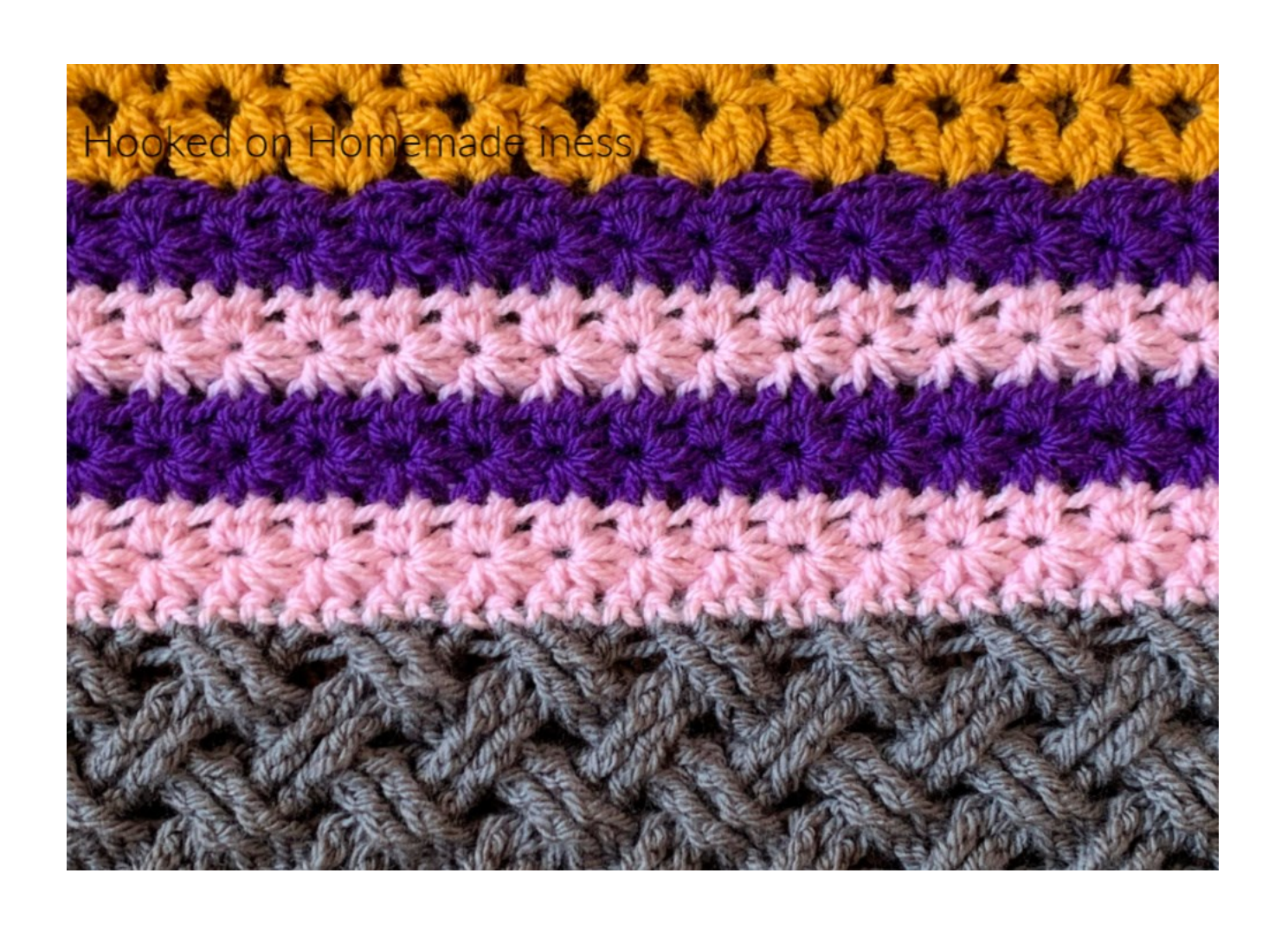
Stitch Sampler Scrapghan Part 11 - Star Stitch