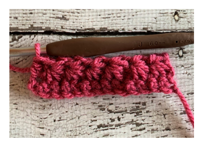
Row 95: ch 2, turn, 2 hdc in the "eye" of each star stitch across, hdc in last stitch (122 hdc)

repeat from * to * across to the end, hdc in last stitch, (same stitch as the last loop from last star stitch of the row) (60 star stitches)