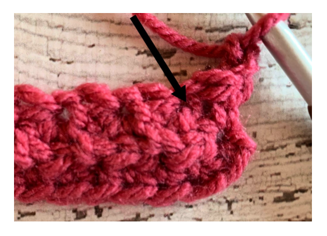
Repeat rows 94 & 95 to Row 102 (122 hdc)