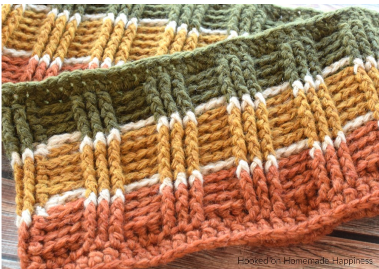
Hooked on Homemade Happiness

The Ribbed Infinity Scarf Crochet Pattern has some gorgeous texture! It's so easy to create this ribbed look. All you need is front post double crochet and back post double crochet!