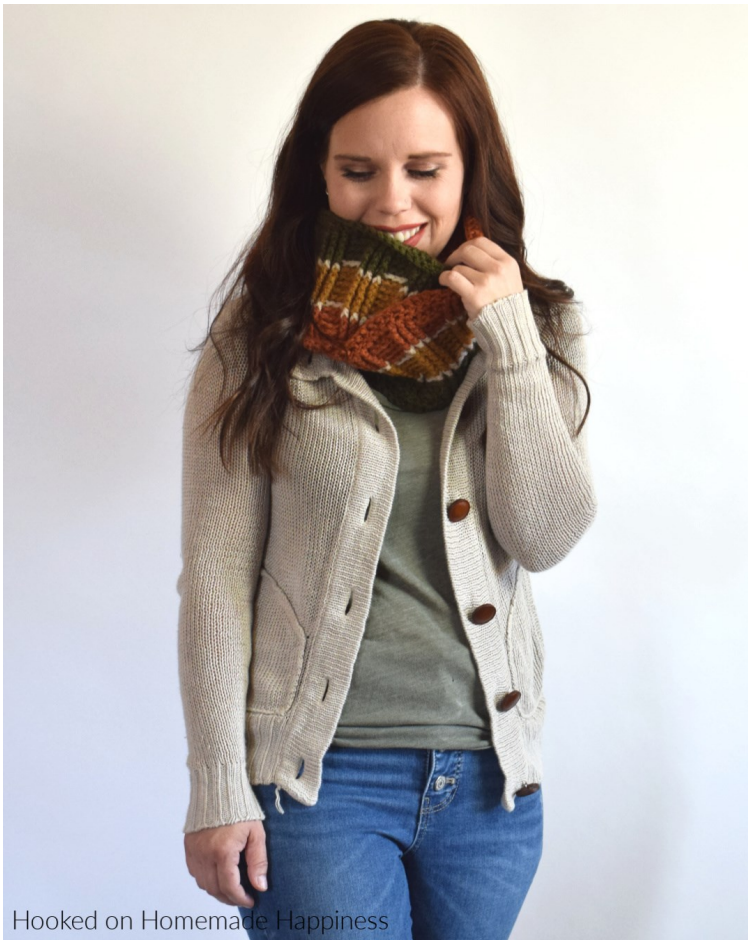
Hooked on Homemade Happiness

The Ribbed Infinity Scarf Crochet Pattern has some gorgeous texture! It's so easy to create this ribbed look. All you need is front post double crochet and back post double crochet!